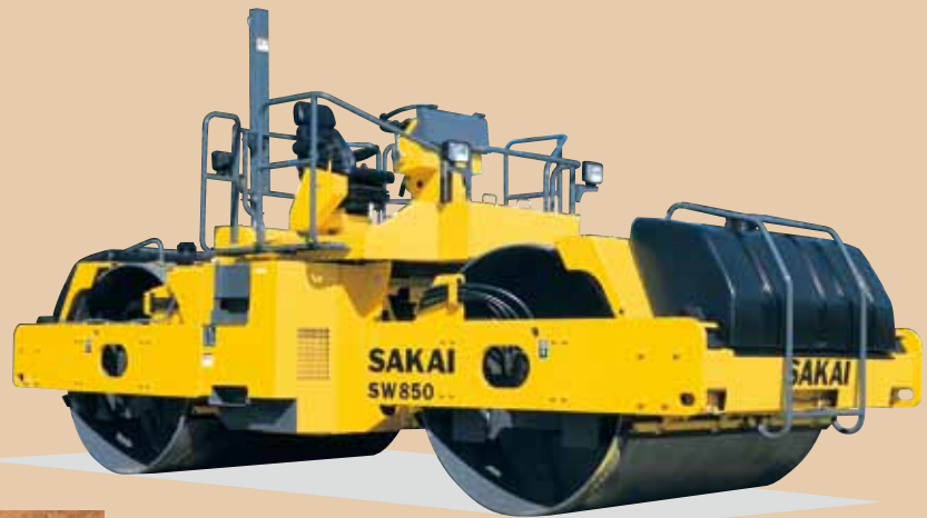
SW850 12.5ton/2.0m (27,560lb/79")