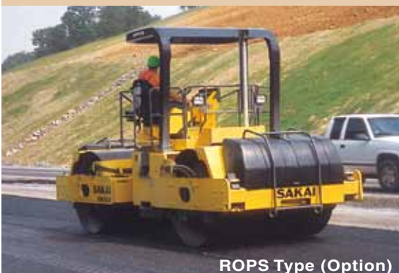
ROPS Type (Option)