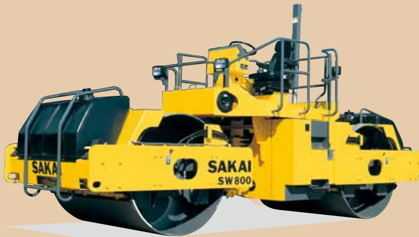
SW800 10.4ton/1.7m (22,930lb/67")

Double Drum Vibratory Roller, articulated, fully hydrostatic drive, including high frequency vibration for Superpave mix